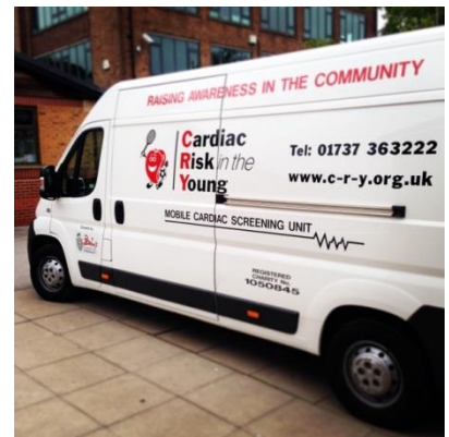
C-R-Y equipment van