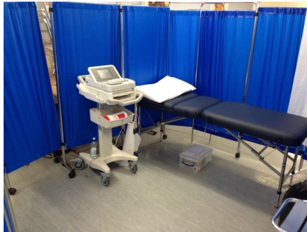
An ECG screening bay